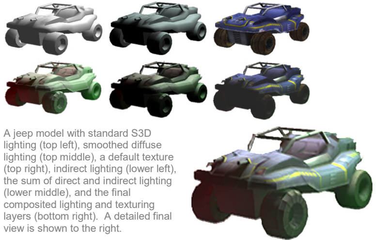
A jeep model with standard 3D lighting (top left), smoothed diffuse lighting (top middle), a default texture (top right), indirect lighting (lower left), the sum of direct and indirect lighting (lower middle), and the final composited lighting and texturing layers (bottom right). A detailed final view is shown to the right.

Next, the photons that have been absorbed into the surrounding surface are sampled for their relative power, where the reflection of the absorbed photon is greater than one (ie where the light is bouncing from an indirect source). The direct and indirect lighting are added, along with an ambient component, to produce the final values that are written to the texture map. This map is then used in place of the default lighting generated by Shockwave 3D, and any other textures for a given material are simply multiplied on top of, or blended beneath, the lightmap. The demo provided shows a standard “Cornell Box” [6] with one red and one green wall such that color bleeding can be observed, where light strikes a colored wall and is then reflected back into the scene.